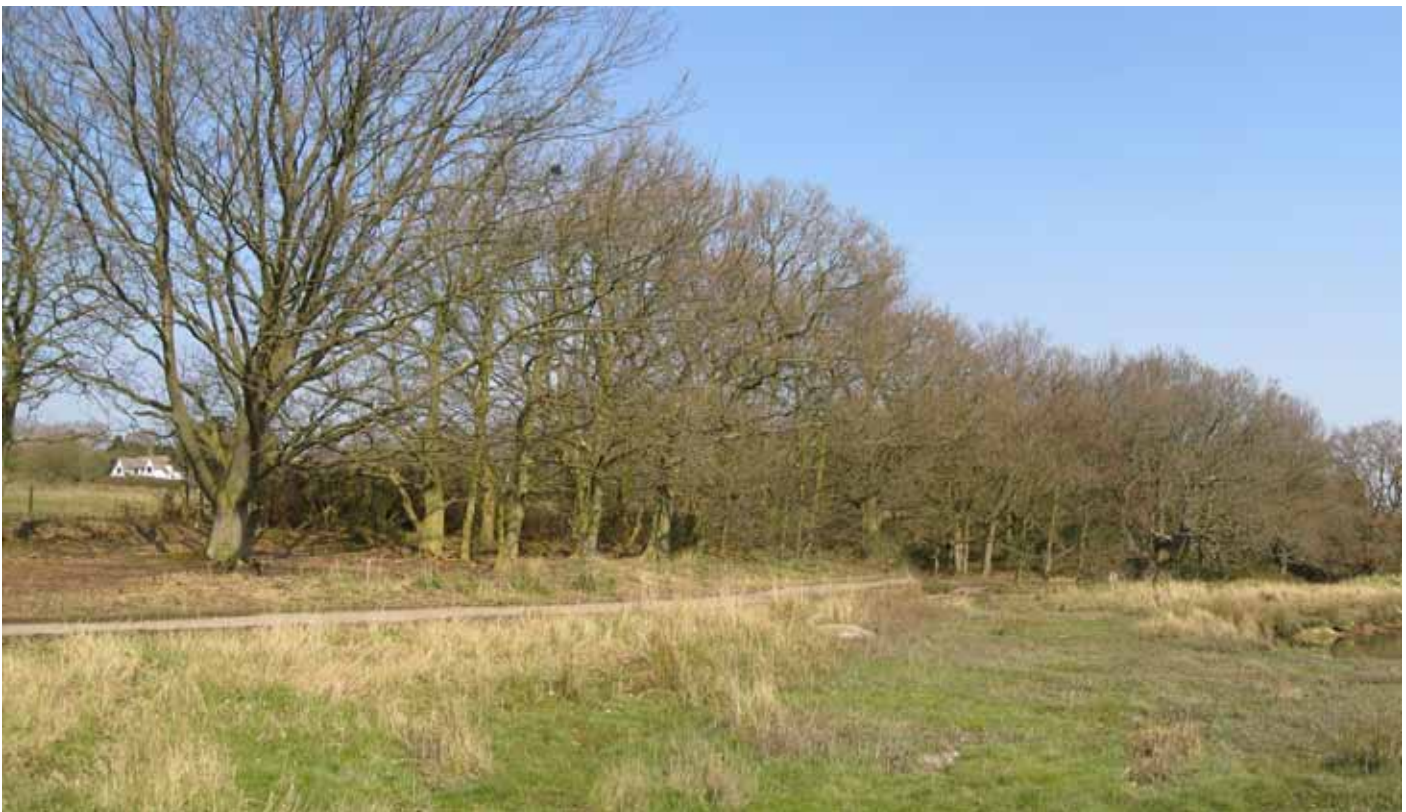
Figure 51. Panorama views north approaching Hamble Green and Hamble River Sailing Club