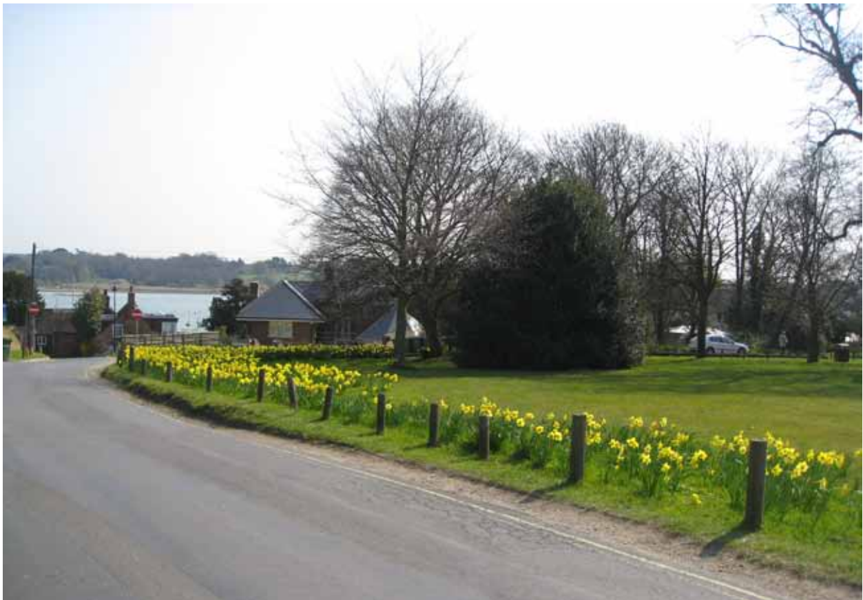
Figure 50. Hamble Green

The Copse – “Early C20 small park, pleasure grounds and walled garden recently developed; major shrub groups and trees retained in housing development.”