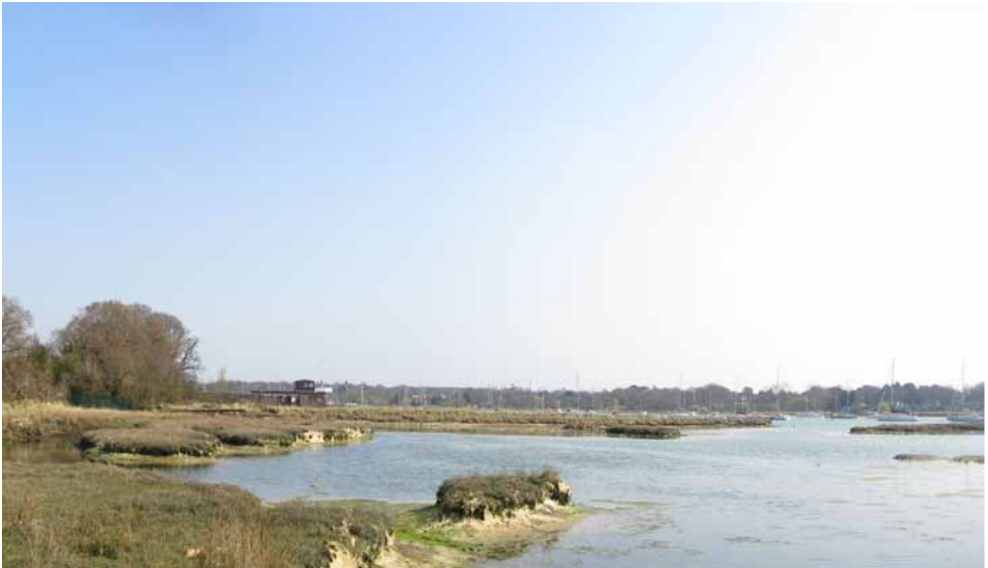
Figure 51. Panorama views north approaching Hamble Green and Hamble River Sailing Club