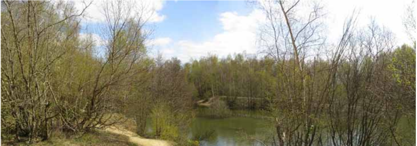
Figure 2. Allbrook Clay Pit panorama