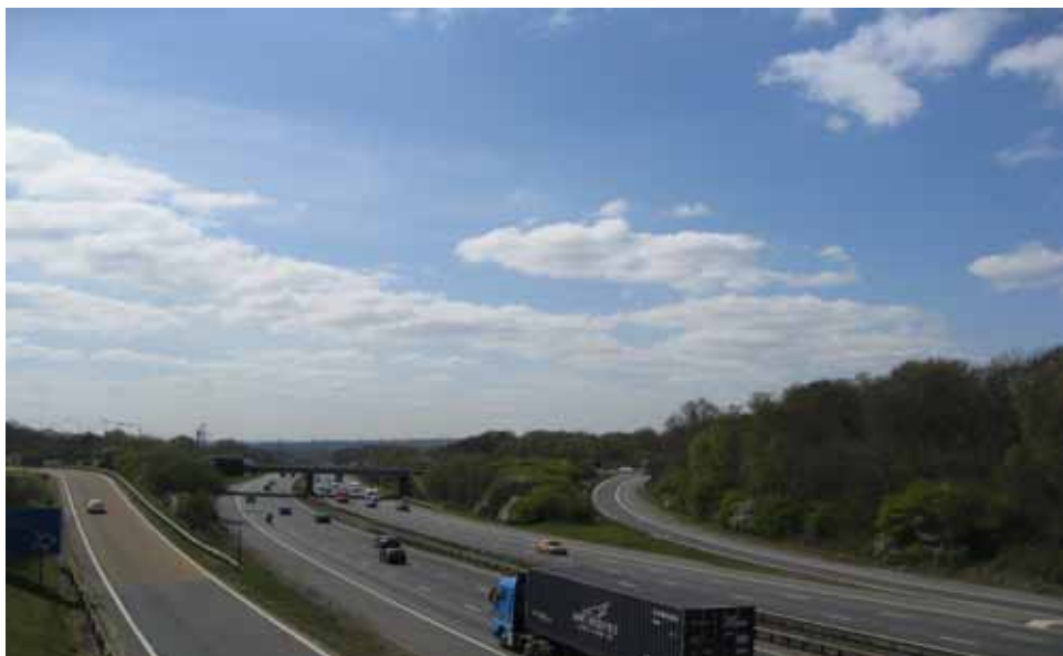
Figure 1. M3 Junction 12 looking south