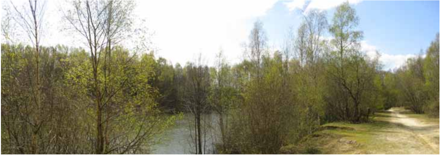
Figure 2. Allbrook Clay Pit panorama