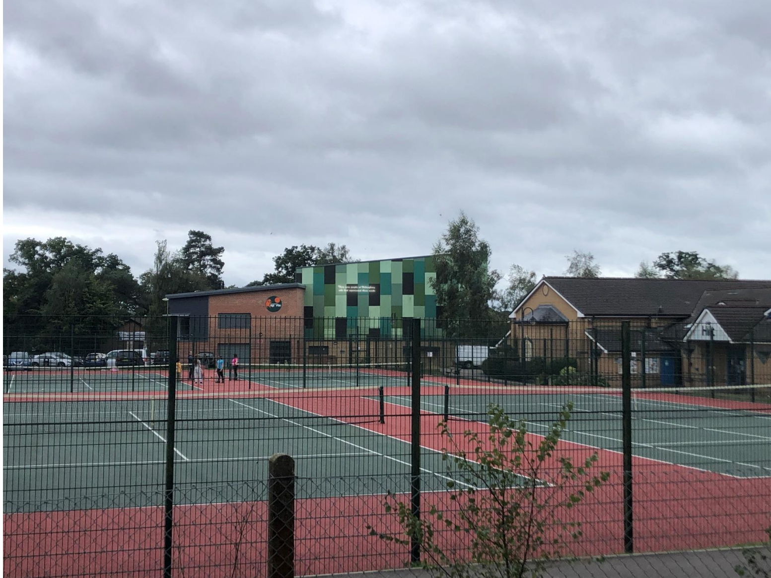
Fig. 5: Alternative position (not preferred) as viewed from north of tennis courts.