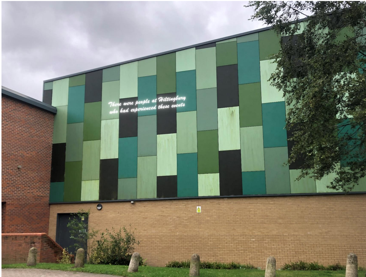
Fig. 4: Alternative north facing location on green panelling (not preferred).