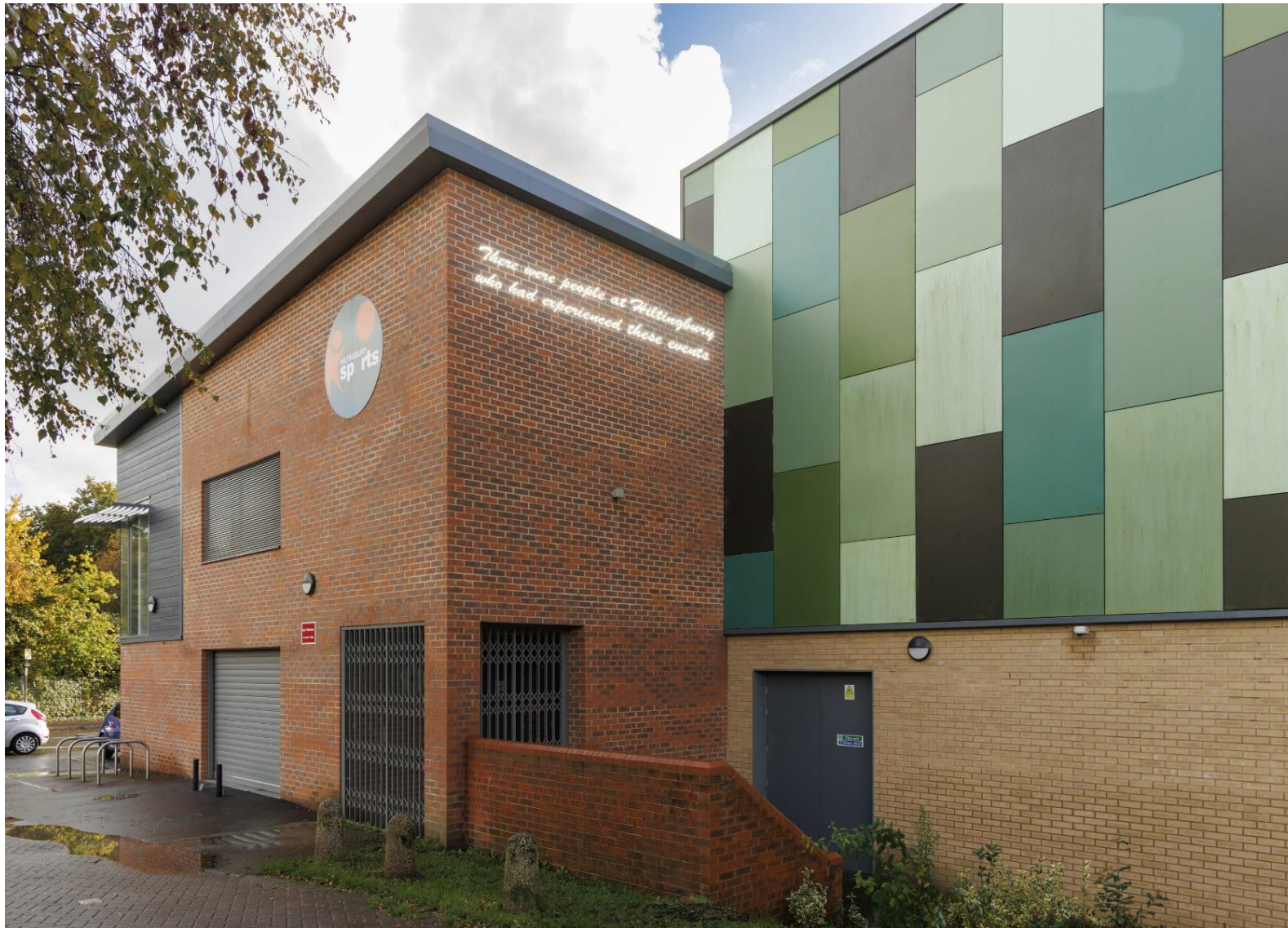
Fig. 1: View of proposed sign work on Hiltingbury Sports from the path leading to The Hilt.