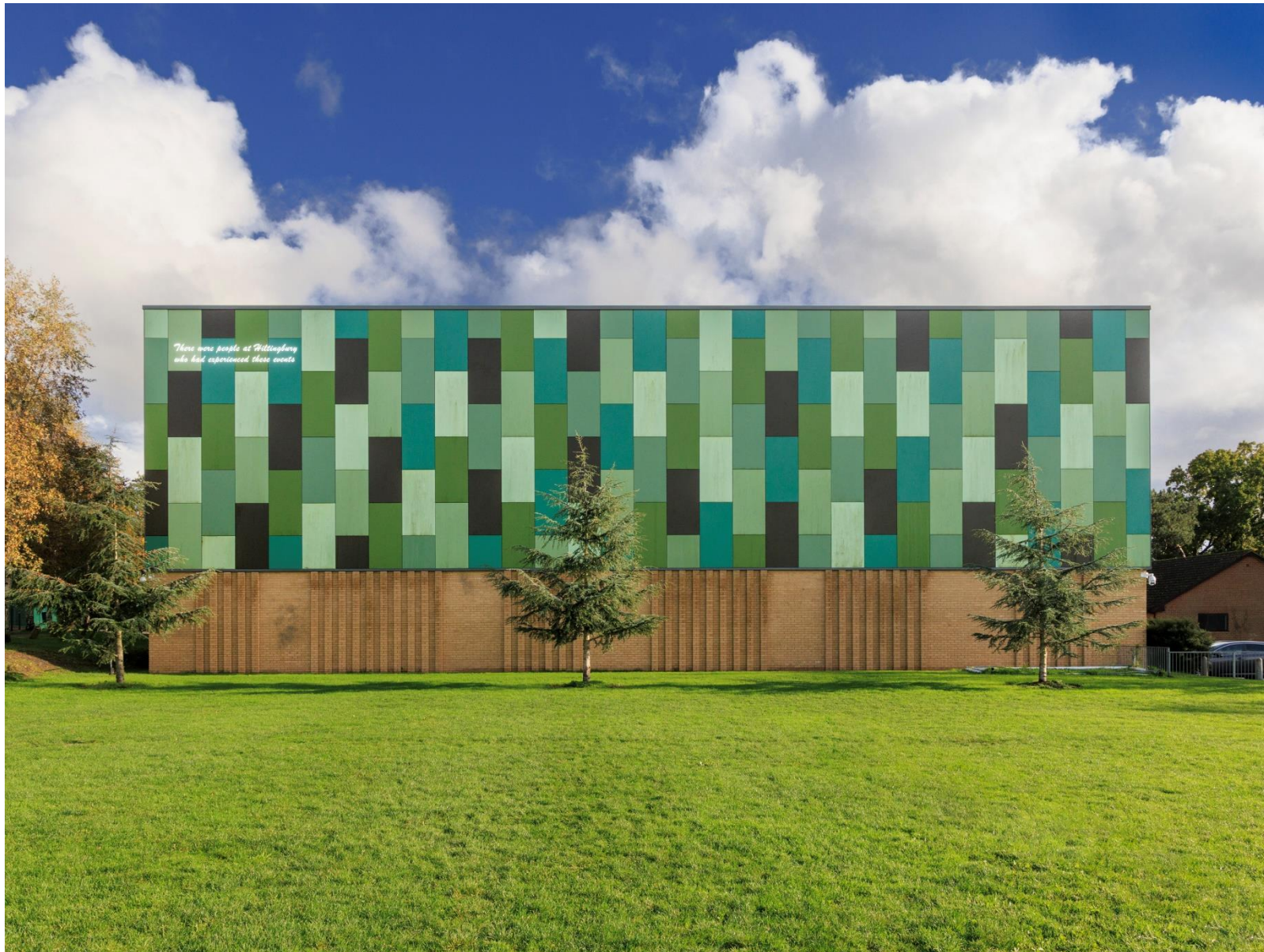
Fig. 3: Alternative west-facing position on green panelling (not preferred).