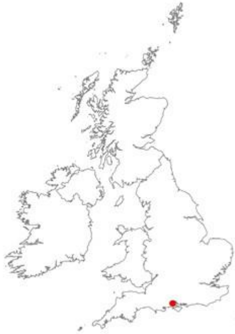
Location of The New Forest SAC/SCI/cSAC