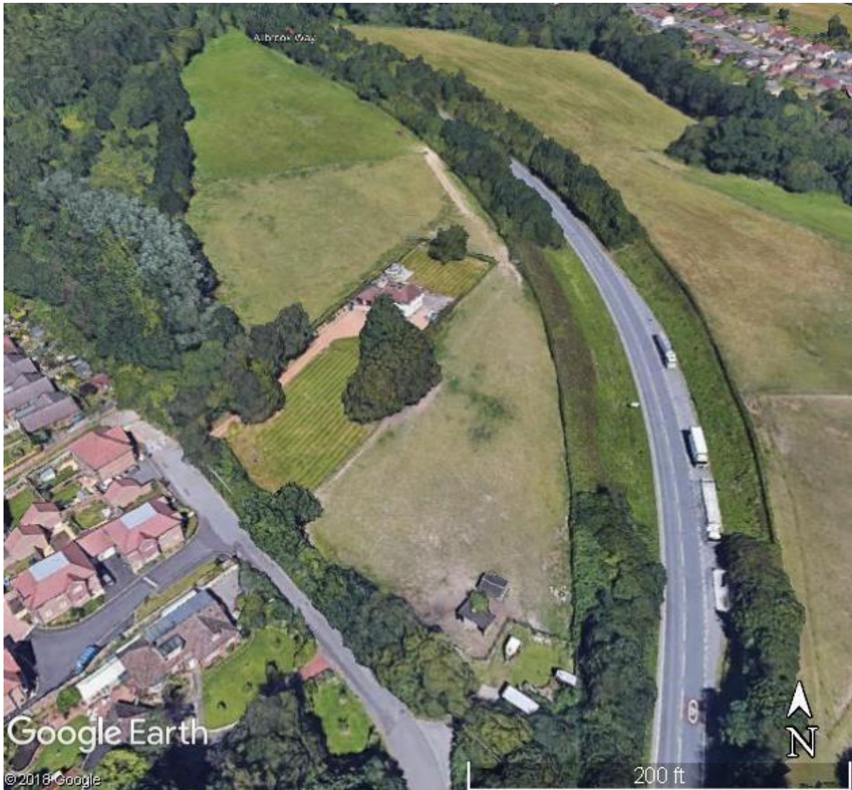
Photo 1: Aerial View of the whole site – Knowle Hill.